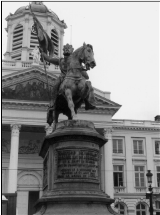
(1) Statue of Godefroy in Brussels