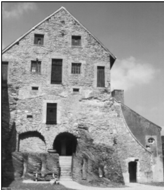
(2) Godefroy's castle in Bouillon