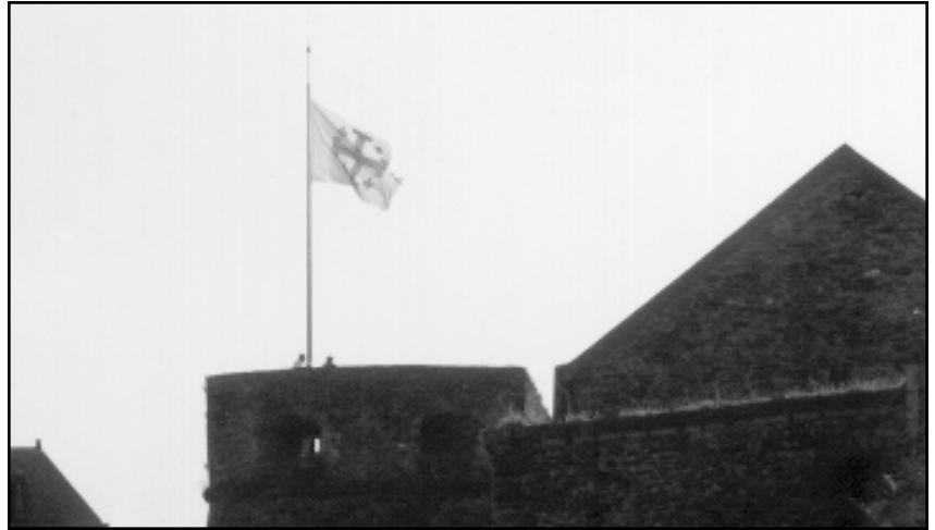
(3) Our flag above the castle