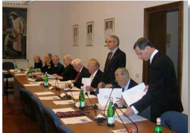
Photo: Members of the Grand Magisterium during a break

At the conclusion of the semi-annual meeting there is a closing dinner in honor of the Cardinal Grand Master. In recent years this has been held at the Casina Pio IV a sixteenth century villa in Vatican City, the home of the Pontifical Academy of Sciences.