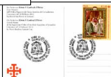
The special cancellation honoring Cardinal O'Brien