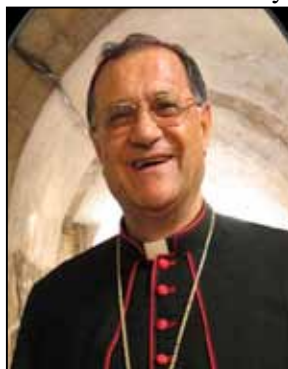
HIS BEATITUDE FOUAD TWAL

His Beatitude Fouad Twal will be the Keynote speaker of the 2012 Annual Meeting of the North Central Lieutenancy, USA - Equestrian Order of the Holy Sepulchre of Jerusalem in Indianapolis, Indiana, September 28 through 30, 2012. This year's conference will use two important events in the life of the Catholic Church to direct the focus of the speakers' forum: the Synod of Bishops for the Middle East (October 2010), and the Year of Faith for the New Evangelization (begins October 2012)