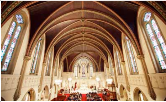
Interior of St. John the Evangelist Church, Indianapolis