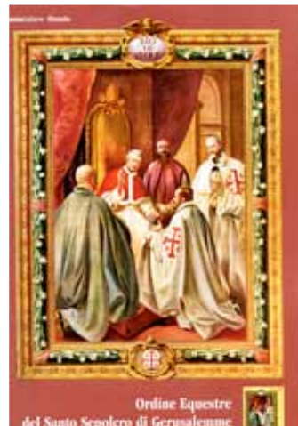
The artwork for the Holy Sepulchre stamp

In November, 2011 the POSTEitaliane issued a € .60 stamp celebrating the Equestrian Order of the Holy Sepulchre. Also issued were First Day Covers, Post Cards, a bookmark and an elaborate folder containing all these postal items plus a brochure, in Italian and English, detailing the history of the Order. Just recently an additional special cancellation was issued to commemorate the elevation of Archbishop O'Brien to the College of Cardinals. Anyone visiting Rome who wishes to obtain these items should call at POSTEitaliane philatelic office in the P.zza. San Silvestro between the hours of 10-2, weekdays.