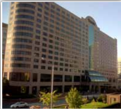
The Westin, Indianapolis - Host Hotel