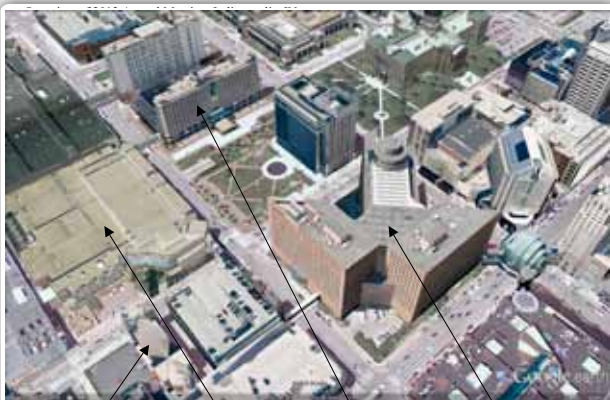
St. John the Evangelist Church Convention Center The Westin Hotel The Hyatt Regency

A warrior is often defined as a person who goes to war, a soldier. However, it can also mean one who “shows or has shown great vigor, courage, or aggressiveness” (www.dictionary.com) in many different fields. Knights have traditionally been associated with the concept of being warriors due to a history of engaging in warfare for the sake of the kingdom. However, over time as we have distanced ourselves from martial activities to pursue more spiritual and diplomatic paths in defense of the kingdom, we knights and ladies (and I think in our modern era we definitely include the ladies) have minimized or have even forgotten our calling to be warriors. In this article, I intend to continue elucidating on my thoughts regarding the spirituality of the EOHSJ and in turn to invite our membership to embrace our role as warriors in the Church and in the world as knights and ladies for it is truly our responsibility and calling to be warriors.