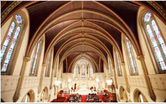
Interior of St. John the Evangelist Church, Indianapolis