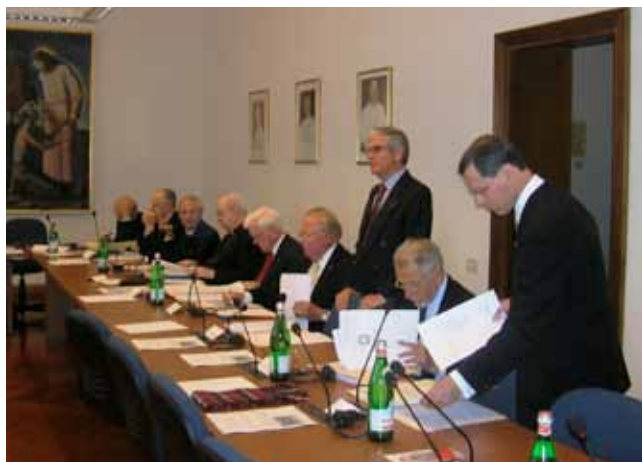
Photo: Members of the Grand Magisterium during a break

At the conclusion of the semi-annual meeting there is a closing dinner in honor of the Cardinal Grand Master. In recent years this has been held at the Casina Pio IV a sixteenth century villa in Vatican City, the home of the Pontifical Academy of Sciences.