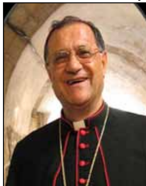
HIS BEATITUDE FOUAD TWAL

His Beatitude Fouad Twal will be the Keynote speaker of the 2012 Annual Meeting of the North Central Lieutenancy, USA - Equestrian Order of the Holy Sepulchre of Jerusalem in Indianapolis, Indiana, September 28 through 30, 2012. This year's conference will use two important events in the life of the Catholic Church to direct the focus of the speakers' forum: the Synod of Bishops for the Middle East (October 2010), and the Year of Faith for the New Evangelization (begins October 2012)